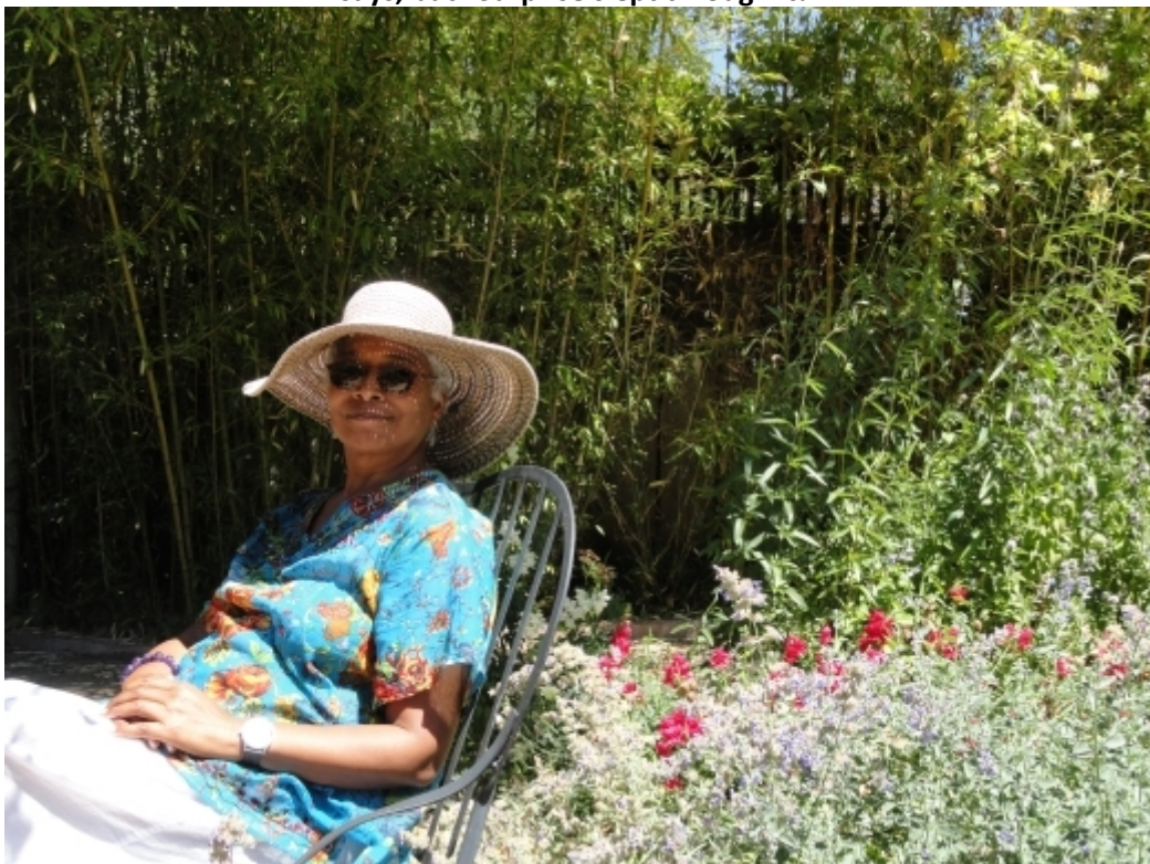
Walker at her country home in Northern California, where she has lived since the early 1980s. “What attracted me to this part of the world—Northern California—is really the resemblance to Georgia that it has,” she once told an interviewer. “This has been a very good place for me,” she went on, “a very good place for dreaming.”